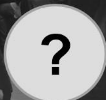
Possibly To Be Announced

MacroVoices Live 2018 – Toronto, Canada – August 10, 2018